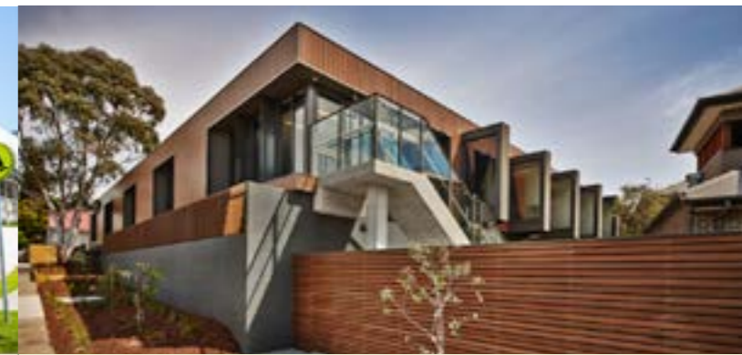
MITCHAM PRIVATE HOSPITAL MITCHAM, VIC