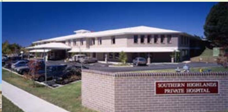
SOUTHERN HIGHLANDS PRIVATE HOSPITAL, BOWRAL