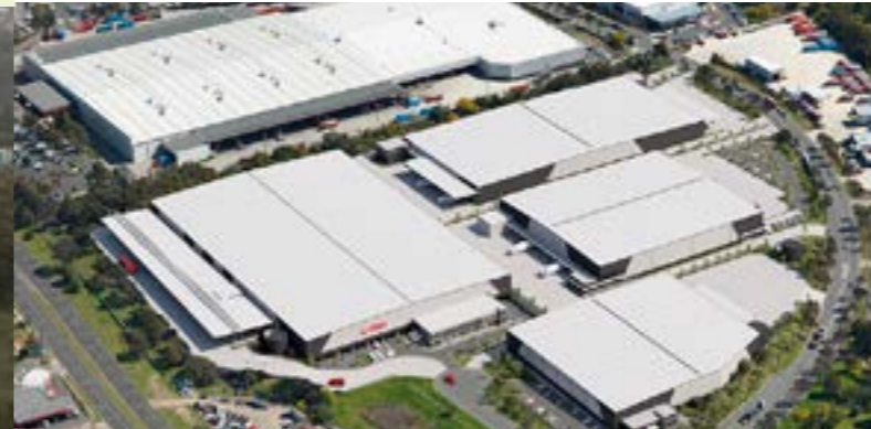
AUSTRALIA POST DISTRIBUTION FACILITY, CHULLORA Charter Hall $28 MILLION