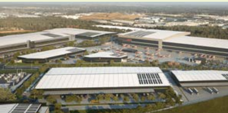
OAKDALE CENTRAL (SSDA) INDUSTRIAL ESTATE Goodman $250 MILLION