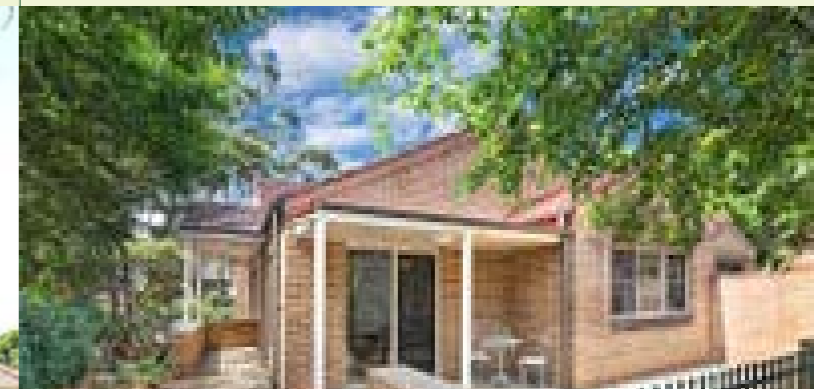
CALVARY RYDE RETIREMENT COMMUNITY