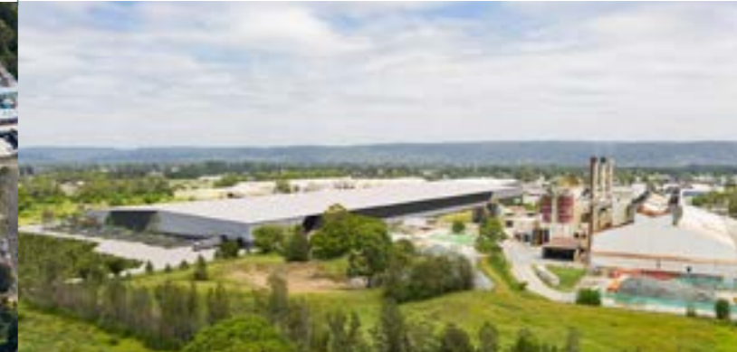
OI WAREHOUSE AND DISTRIBUTION FACILITY, PENRITH Cadence $40 MILLION