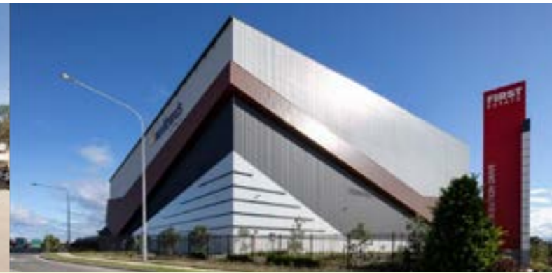
SNACK BRANDS Altis Property Partners $70 MILLION