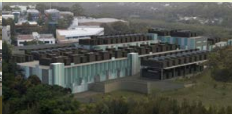
LANE COVE DATA CENTRE (SSDA) Greenbox Architecture $216 MILLION