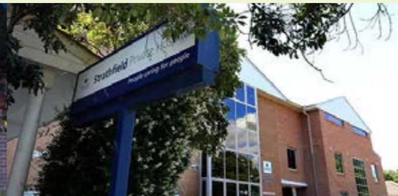
STRATHFIELD PRIVATE HOSPITAL, BURWOOD