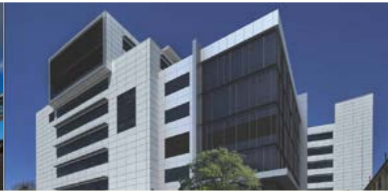
WOLLONGONG PRIVATE HOSPITAL, WOLLONGONG