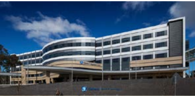
CALVARY BRUCE PRIVATE HOSPITAL, CANBERRA