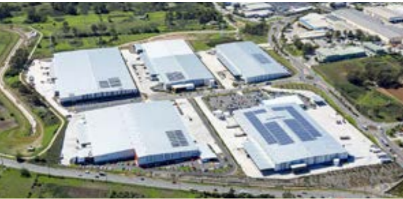
HORSLEY DRIVE BUSINESS PARK Western Sydney Parklands Trust $180 MILLION