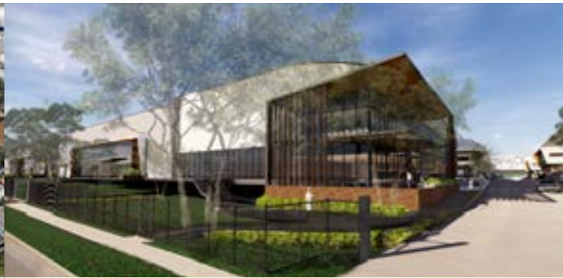
FERNDELL STREET SOUTH GRANVILLE, MULTI-UNIT SCHEME Dexus $71 MILLION