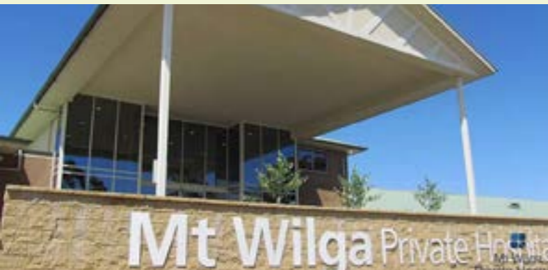
MT WILGA PRIVATE HOSPITAL, HORNSBY