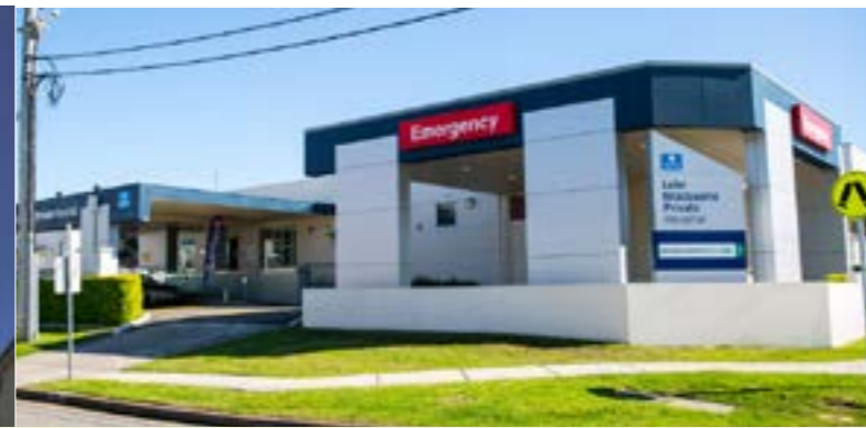
LAKE MACQUARIE PRIVATE HOSPITAL, GATESHEAD