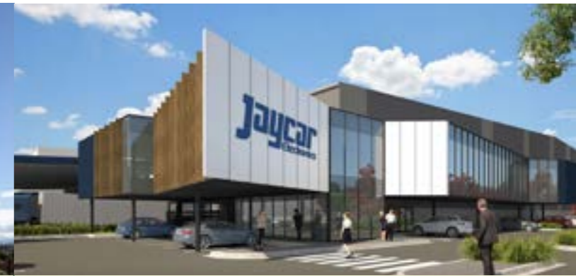
JAYCAR HIGH BAY WAREHOUSE, EASTERN CREEK Frasers Property Australia $25 MILLION