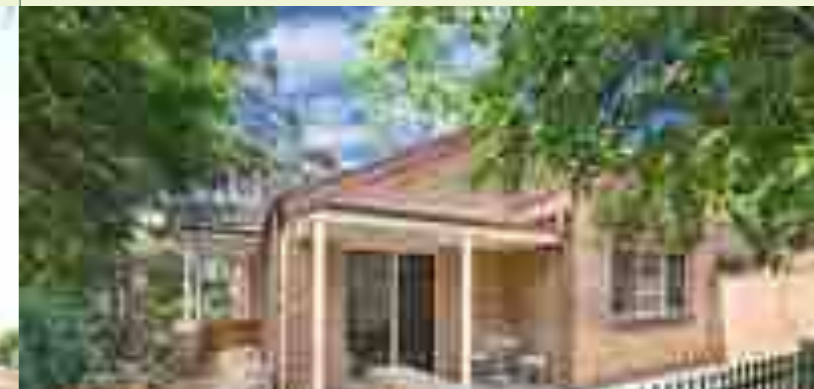
CALVARY RYDE RETIREMENT COMMUNITY Calvary Health Care