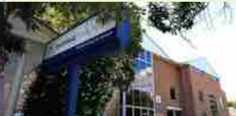
STRATHFIELD PRIVATE HOSPITAL, BURWOOD Ramsay Health Care