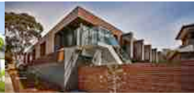
MITCHAM PRIVATE HOSPITAL MITCHAM, VIC Ramsay Health Care