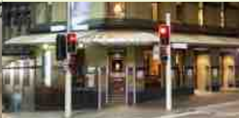
CITY HOTEL KENT STREET, SYDNEY Brett Strauss