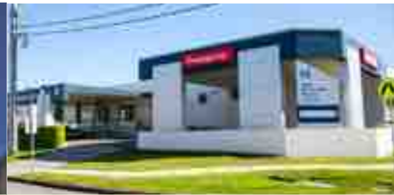
LAKE MACQUARIE PRIVATE HOSPITAL, GATESHEAD Ramsay Health Care