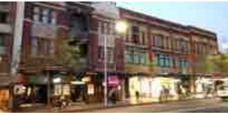
THE EXCHANGE HOTEL DARLINGHURST, SYDNEY Eastern Property Alliance