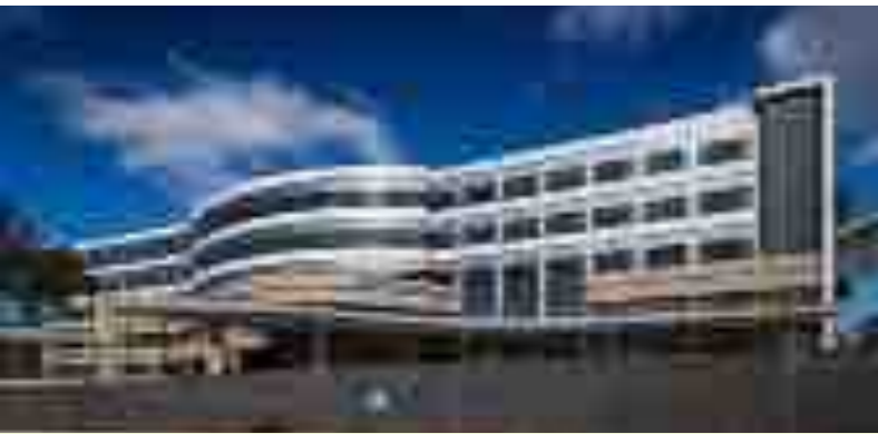
CALVARY BRUCE PRIVATE HOSPITAL, CANBERRA Calvary Health Care