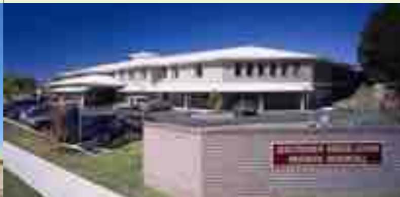
SOUTHERN HIGHLANDS PRIVATE HOSPITAL, BOWRAL Ramsay Health Care