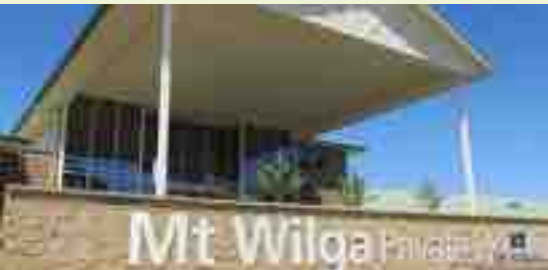
MT WILGA PRIVATE HOSPITAL, HORNSBY Ramsay Health Care