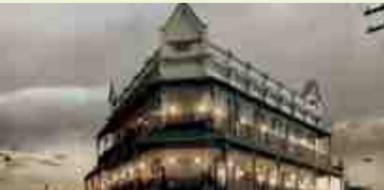
THE EXCHANGE HOTEL BALMAIN, SYDNEY Eastern Property Alliance