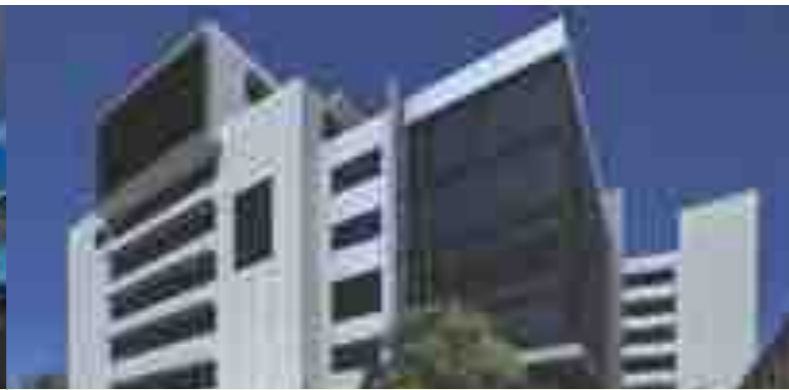
WOLLONGONG PRIVATE HOSPITAL, WOLLONGONG Ramsay Health Care