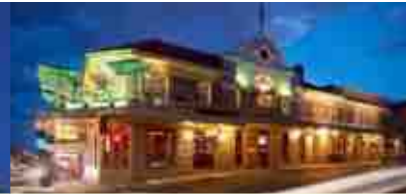
TOWN HALL HOTEL BALMAIN, SYDNEY Eastern Property Alliance