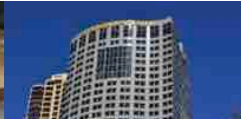
SHANGRI LA HOTEL REFURB THE ROCKS, SYDNEY Pure Projects