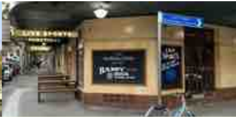
KURRAJONG HOTEL ERSKINEVILLE, SYDNEY Eastern Property Alliance