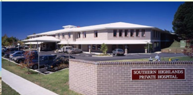
SOUTHERN HIGHLANDS PRIVATE HOSPITAL, BOWRAL