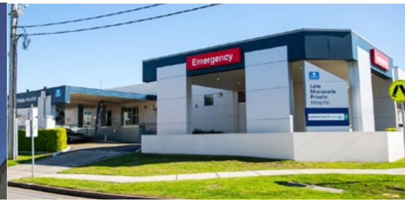
LAKE MACQUARIE PRIVATE HOSPITAL, GATESHEAD