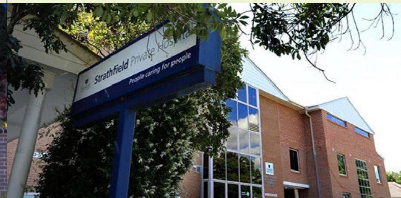
STRATHFIELD PRIVATE HOSPITAL, BURWOOD