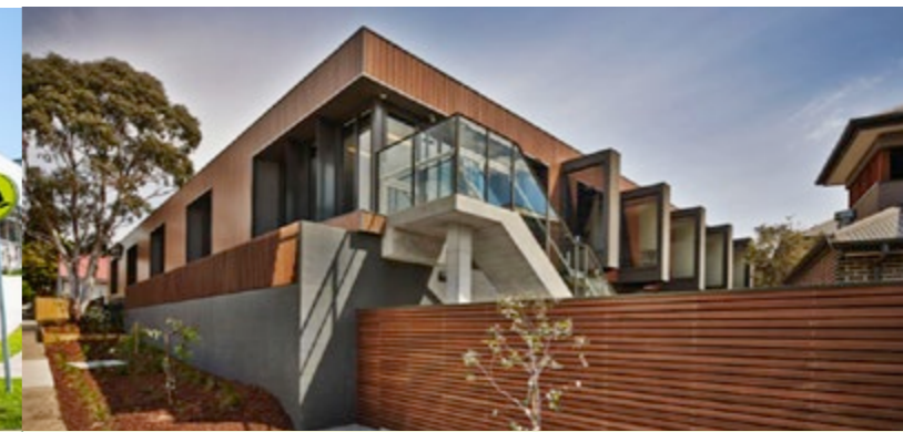
MITCHAM PRIVATE HOSPITAL MITCHAM, VIC