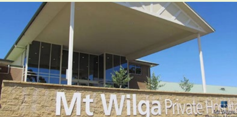
MT WILGA PRIVATE HOSPITAL, HORNSBY